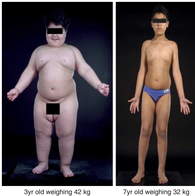
3yr old weighing 42 kg